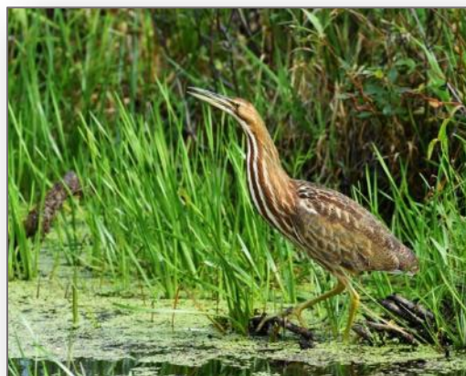
Eagle Point WMA at Missisquoi National Wildlife Refuge provides excellent opportunities to see a variety of wetland and marsh species such as American bittern.

Fish Largemouth and smallmouth bass, chain pickerel, yellow perch, bullheads and pumpkinseed sunfish may be caught in the Johns river mouth and in Hall's Creek. Large brown trout journey up the Johns River in the fall to spawn, as do rainbow trout in the spring.